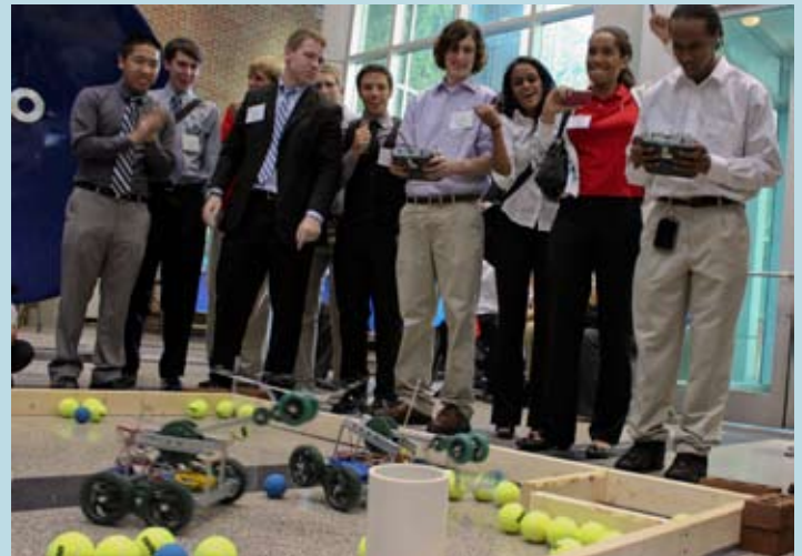
Attendees participate in a conference design competition.

T he UF chapter of ASME hosted the 2012 Student Professional Development Conference on March 30, March 31 and April 1.