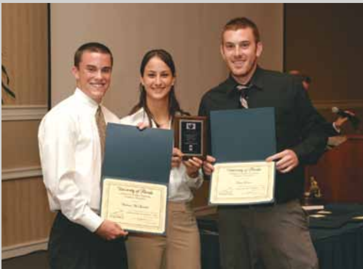
Proud MAE students display their awards