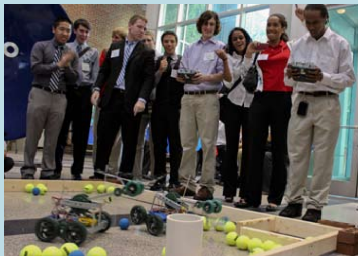
Attendees participate in a conference design competition.

T he UF chapter of ASME hosted the 2012 Student Professional Development Conference on March 30, March 31 and April 1.