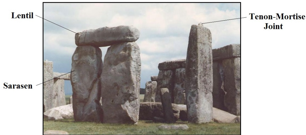
CLOSE-UP OF STONEHENGE (picture taken in 1961)

At that time one was free to roam throughout the structure, unlike today where a fence restricts access.